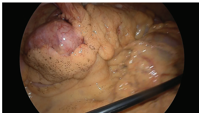
Figure 1. An example of intraoperative finding of large caecal tumour with potentially T4 disease.

Our technique has previously been published (12). Briefly, the patient is placed in a lithotomy position with reverse