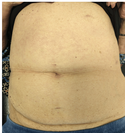
Figure 3. Clinic review of the patient's abdomen 2 weeks after laparoscopic right hemicolectomy with transvaginal NOSE.

Histopathology results are detailed in Table 1. All the specimens had R0 and clear resection margins. The median lymph node