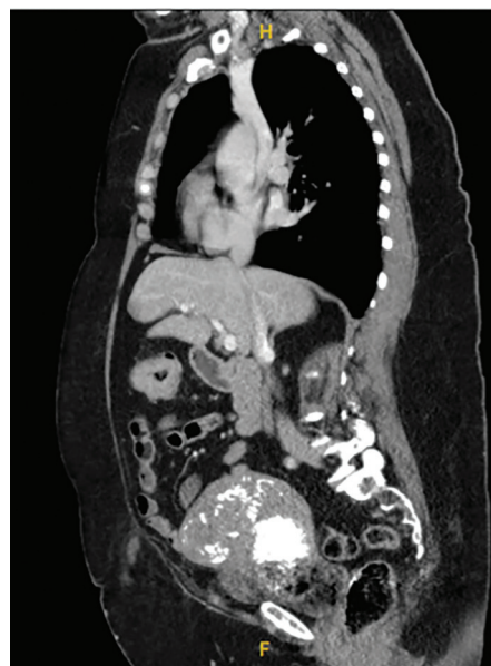
Figure 5. Preoperative sagittal view of CT scan for assessment of the uterus where the large fibroid made transvaginal NOSE not suitable.

This study is limited by the small numbers as a report of initial experience. The operative time may not be fully reflective