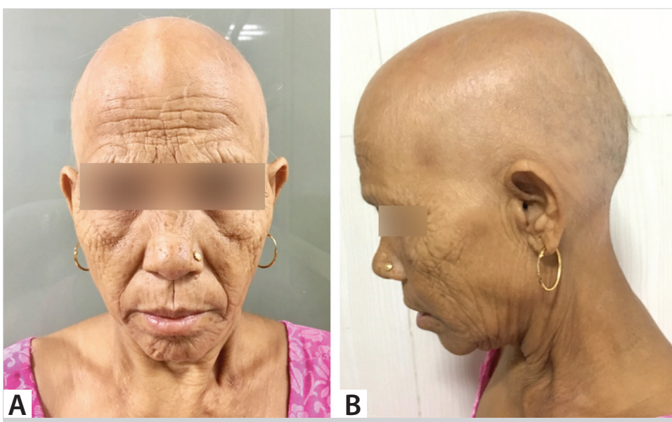
Figure 1. A. Front view of patient's face showing total loss of facial and scalp hair. B. Lateral view of the patient with alopecia totalis.