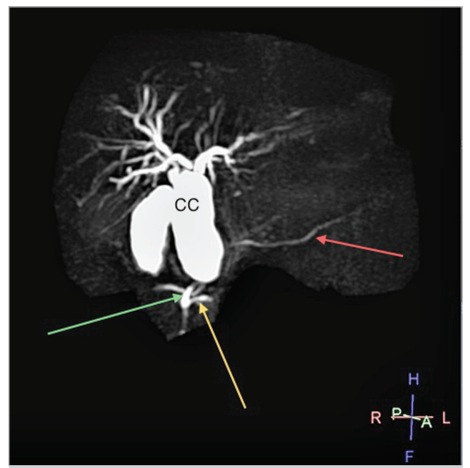
Figure 2. Magnetic resonance cholangiopancreatography (MRCP) choledochal cyst (CC) with incomplete (Type 3) pancreatic divisum (PD). Red arrow; dorsal pancreatic duct draining separately into the minor papilla with filamentous communication with the ventral duct (yellow arrow) suggestive of incomplete PD. Green arrow; long common channel formed by common bile duct and ventral duct draining into the major papilla.

A 35-year-old female patient presented with pain in the abdomen ongoing for 15 days. MRCP showed Type I CC with incomplete Type 3 pancreatic divisum (Figure 2). The patient underwent complete excision of the cyst but developed a low output biliary leak, which was managed conservatively. The patient has