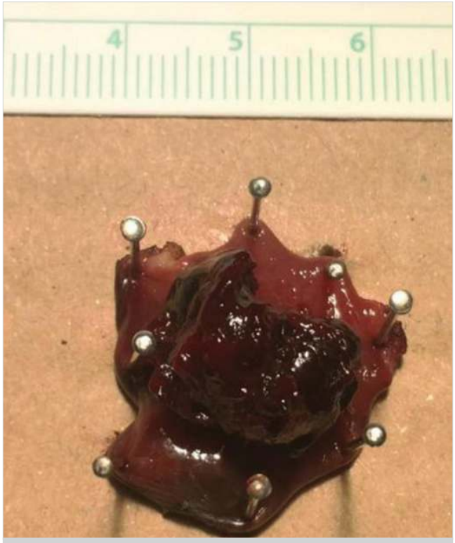
Figure 2. WLE specimen excised in the anal canal.

region, in 35% of the distal rectum, and in our study, the tumor was observed in 36% of the distal rectum (7). Male sex, perineural invasion, depth of invasion, lymph node metastasis and distant metastasis are poor prognostic factors and indicates that the patient's survival will be short.