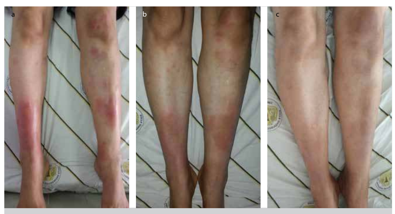
Figure 1. a-c. Pretibial erythematous nodules in the patient with granulomatous mastitis. Upon admission to the clinic (a), Two days after initiation of systemic corticosteroid treatment (b), One week after initiation of treatment (c)