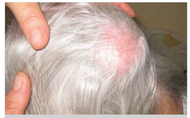
Figure 1. Scalp metastasis on physical examination