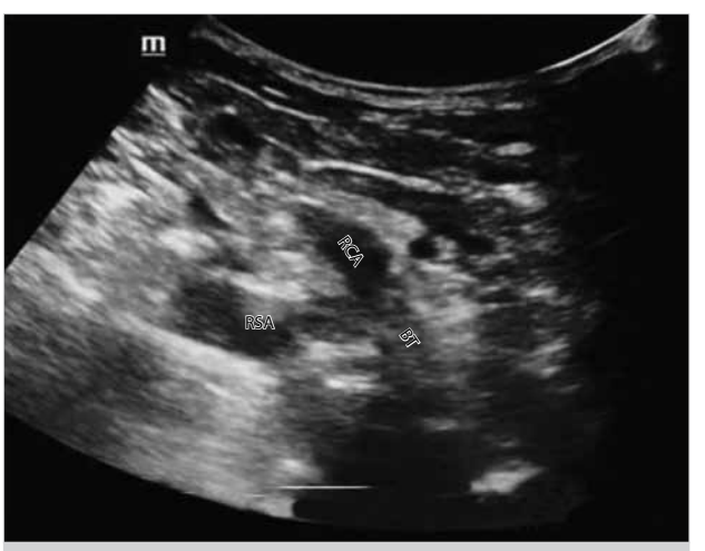
Figure 2. The right carotid artery combines with right subclavian artery forming the brachiocephalic trunk to reach the aortic arch. Ultrasonography clearly depicts the Y sign