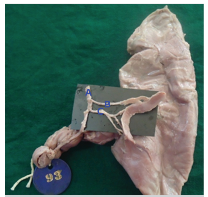
Figure 1. Accessory appendicular artery. A. Ileocolic artery, B. Appendicular artery, C. accessory appendicular artery.