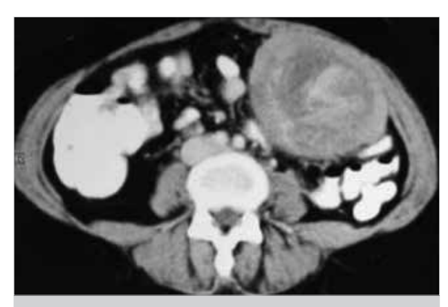
Figure 3. CT revealed a tumoral mass with smooth borders and cystic, necrotic and hyperdense foci in the center

body and cause medico-legal issues. The first type of reaction is aseptic fibrinous reaction in which the adhesion and encapsulation results in a granuloma formation and remain asymptomatic for a long time (3-5). Then, similar to our cases, patients present with the symptoms of pseudotumor syndrome including abdominal pain, palpable mass, vomiting, diarrhea, abdominal distension, anorexia, and weight loss. Yildirim et al. (6) reported 14 patients with gossypiboma; 10 had aseptic fibrinous reactions, and the interval between first surgery and the onset of symptoms in their series varied between 12 months and 40 years. The second type of foreign body reaction is exudative inflammatory reaction, which usually is detected immediately following the surgery and by symptoms of the abscess or fistula formation (7). They may account for visceral perforation or obstruction by migrating into the luminal organs.