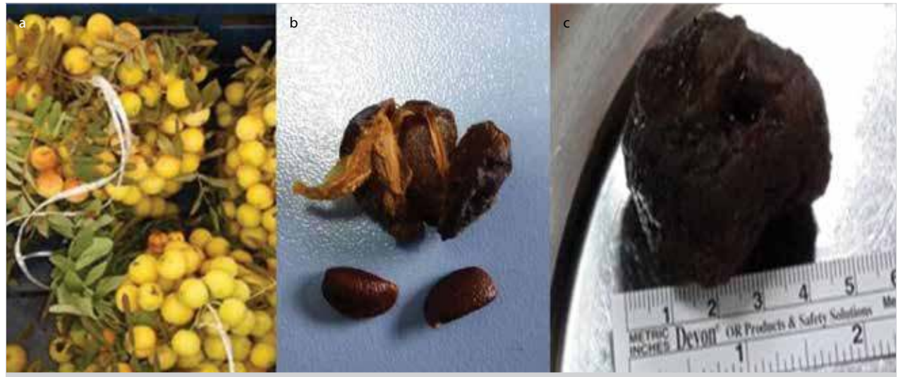
Figure 1. a-c. Sorbus domestica. (a) Fresh SD, (b) dried SD, (c) phytobezoar formation caused by SD

Two patients experienced postoperative morbidity. The first patient developed postoperative ileus four days after the first bezoar operation. Laparotomy revealed a bezoar proximal to the first enterotomy incision. Because its edges were spiked, a segmental resection was performed to retrieve the bezoar. Endto-end intestinal anastomosis was then performed. In fact, the bezoar was observed during the first operation in the stomach, and it was planned to attempt endoscopic digestion after the