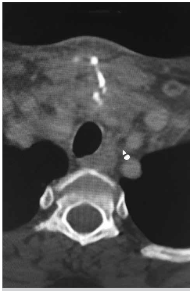
Figure 3. CT view of the fistula tracts extending from the incision line to the trachea

During this period, a total of 14 patients were admitted with a diagnosis of suture reaction. Since one of these patients had