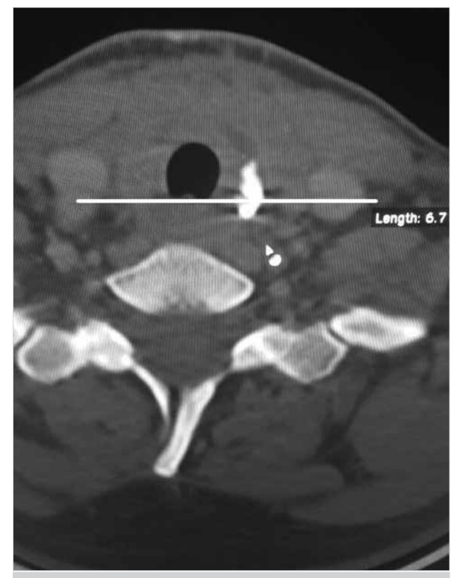
Figure 4. CT view of fistula tracts extending from the incisional line to the trachea

On CT, fistula tracts extending from the incision line to the trachea and both lobes of the thyroid gland were detected (Figure 3, 4). The abscess was drained after opening the fistula tract under general anesthesia. The fistula tract was excised and the sutures causing foreign body reaction were extracted from both thyroid lobes adjacent to the trachea.