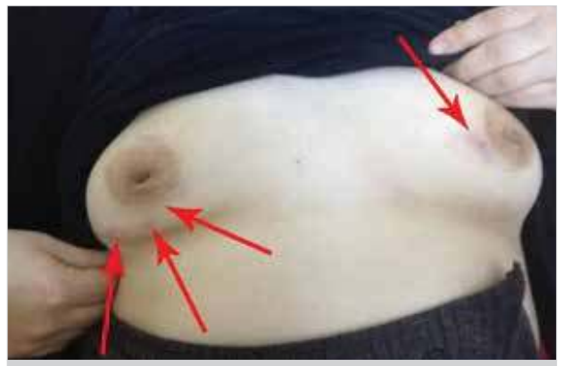
Figure 1. A case with bilateral mastitis: Arrows show external opening

As a rare chronic inflammatory disorder of the breast that may be confused with carcinoma IGM more frequently affects women of the middle age (the third and fourth decades) and is generally encountered within few years of parturition (5). The etiopathogenesis is not well known. Proposed predisposing factors include autoimmunity, oral contraceptive use, infectious agents, tuberculosis, hormonal disorders, pregnancy, hyperprolactinemia, and alpha-1 antitrypsin deficiency (6, 7). The higher incidence of IGM during the postpartum and lactation periods and that among women using oral contraceptives draws attention to hormonal factors. Approximately onethird (33%) of all IGM patients have reported the use of oral contraceptives and cases not related to pregnancy (8, 9). One of our cases reported a history of use of oral contraceptives. Histopathological findings including inflammatory cells in a lobular pattern suggest cellular autoimmune reaction against some histological elements of the breasts. Some cases have been reported to be affected by other autoimmune disorders (10). However, in contrast to other autoimmune disorders, the absence of vasculitis or prominant plasma cell infiltration