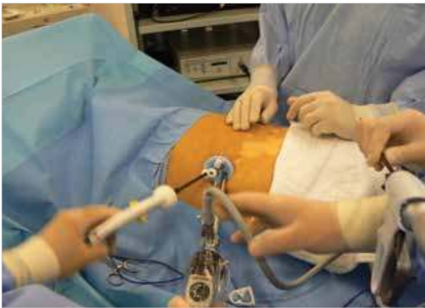
Figure 2. Left adrenalectomy performed with the single-incision laparoscopic surgery procedure

ing polypropylene sutures (number-0), and the procedure was completed by closing the skin using the 3/0 polypropylene suture (Ethicon). The operation time was 45 min.