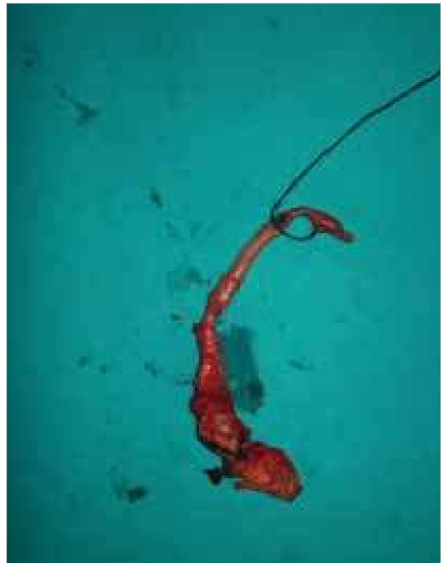
Figure 3. The phlegmonous end portion of the appendix tissue

In this case, there was obviously tenderness, rebound, and defense in the right upper quadrant on physical examination. Moreover, she had anorexia and sometimes nausea complaints