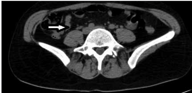
Figure 1. There is contamination in the fatty plans around the cecum

Thus, the diagnosis of acute cholecystitis was excluded. In order to investigate the cause of pain in the abdomen, computed tomography (CT) was requested. CT revealed contamination in the fatty plans around the cecum and adhesive